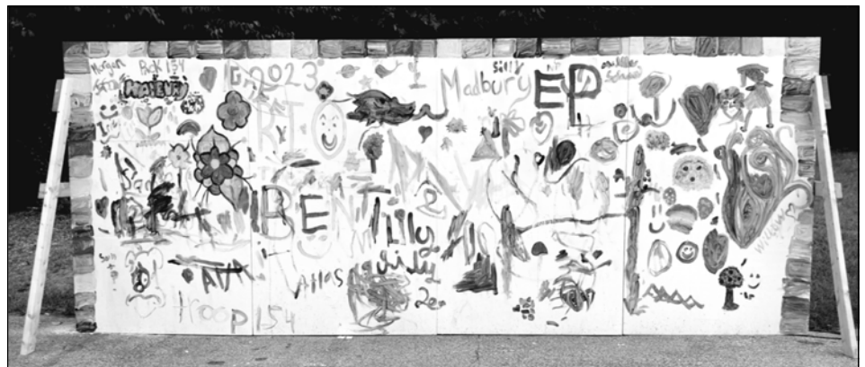
The popular painting wall from Madbury Day 2023.

Congratulations Leah and best wishes at Endicott!"