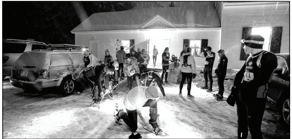
Racers "shoe-up" for moonlight race.